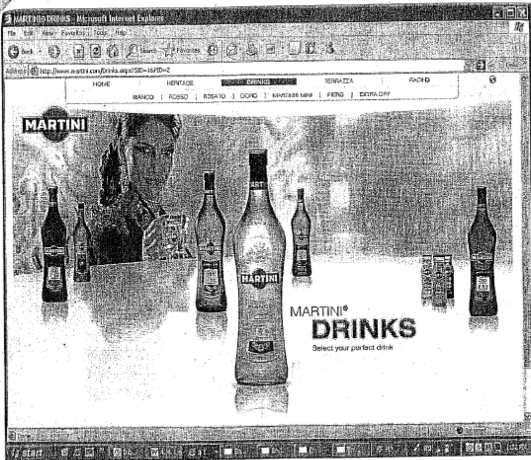
1 st and 2 nd pictures of Exhibit "E"

A careful examination of opposer's and respondent-applicant's respective marks shows that the word "MARTINI" is the dominant feature. In opposer's marks, the word "MARTINI" is either the mark by itself or the predominant word considering the bold and conspicuous presentation of the letters that spell "MARTINI", as well as the placement of the word "MARTINI" on the upper part of the labels where the eyes normally focus upon looking at the goods. Respondent-applicant's mark presented by way of a question centers on the word "MARTINI": The "question" mark stirs one's curiosity about the product and image of "MARTINI". The question of respondent-applicant's mark culminates in the word "MARTINI". It creates visual, aural, and connotative impressions that link up to opposer's "Martini Marks".