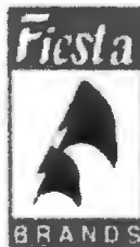
"FIESTA AND DEVICE (COLORED)"