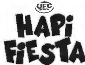
"UFC HAPI FIESTA"